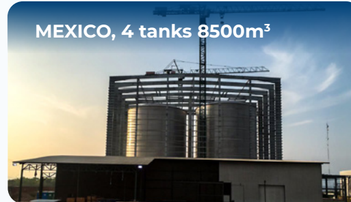
MEXICO, 4 tanks 8500m 3