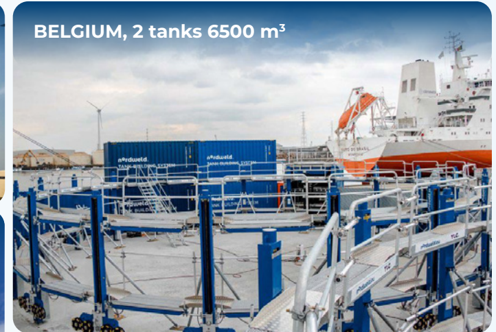
BELGIUM, 2 tanks 6500 m 3