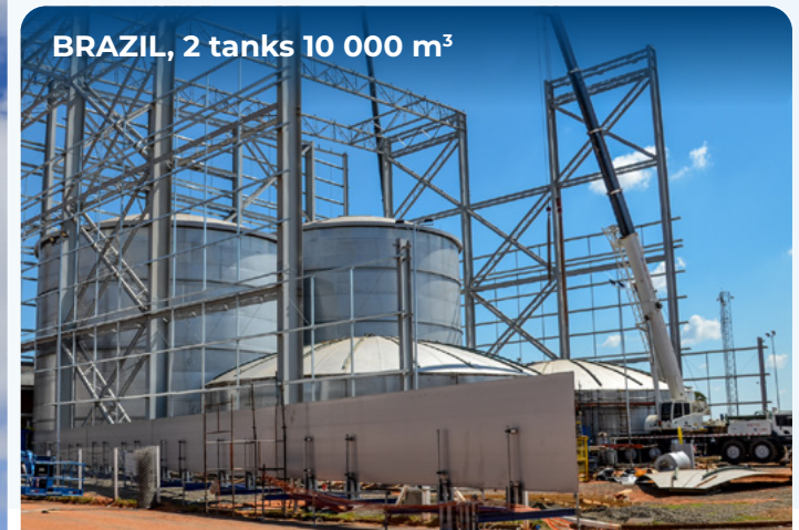
BRAZIL, 2 tanks 10 000 m 3