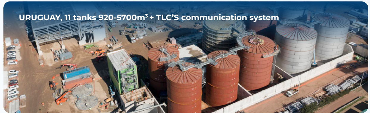
URUGUAY, 11 tanks 920-5700m 3 + TLC'S communication system